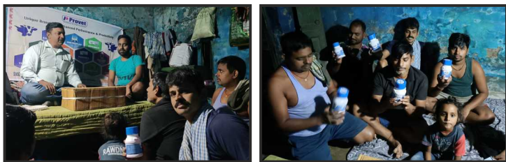
CGM at Barrackpur, MCC, at 24 paraganas, West Bengal, Kolkata H.Q - 21 st Nov, 2022

Customer Group Meeting aimed at providing quality milk production knowledge to the local dairy farmers