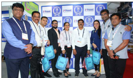
Anupama Feeds and Farms, Mangalore