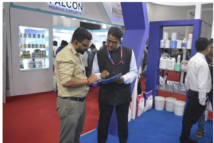
Some of our curious visitors enquiring about the products.

Apart from officials, many hatchery firms, Jay Jay hatcheries and Sapthagiri hatcheries had a small talk on Provet's Aqua products for improving production.