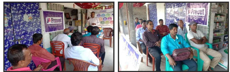
CGM at Titagarh, 24 paraganas, West Bengal, Kolkata H.Q - 19 th Nov, 2022

The surrounding LDA and LI were invited to this meeting and were given the product information.