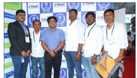
Layer Customers from Chelgere, Karnataka