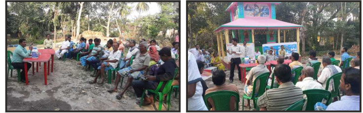
Free Medical Camp at Charghat, 24 paraganas (north), West Bengal, Habra H.Q - 19 th Nov, 2022

Customer Group Meeting was held to educate the dairy farmers about the benefits and to make the best utilization of the nutritional products.