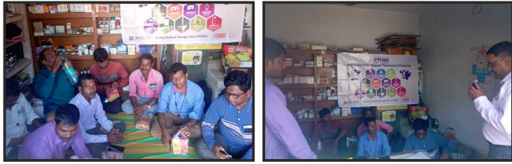
CGM at Mayureswar, Birbhum (Dist.), West Bengal, Burdwan H.Q - 10 th Nov, 2022

Calf a year was the theme of this awareness program which was conducted for the local Para Vets.