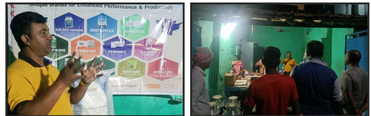
Conference & Seminar at Debra, Paschim Midnapore, West Bengal, H.Q - 19 th Nov, 2022

Calf a year was the theme of this awareness program which was conducted to the local dairy farmers.