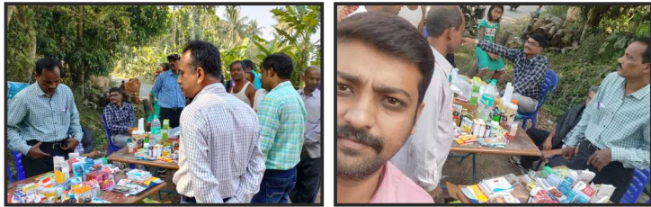
Paravet Meeting at Sagar, 24 paraganas (south), West Bengal, Baruipur H.Q - 11 th Nov, 2022

Provet sponsored for a free health camp that was organised by Dr. Prabir Bhattacharjee Memorial Trust